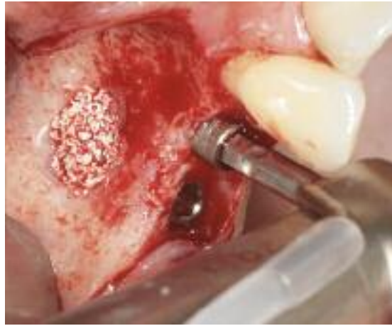
Fig. 11 Positioning the final implant.