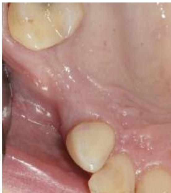
Fig. 1 Clinical baseline situation with missing teeth 14 and 15.

After complete preparation of the implant cavities, we continued by augmenting the sinus cavity with a bone regeneration material, which we had mixed