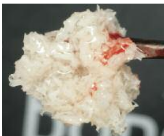
Fig. 6 Augmentation material with Tissue Support.