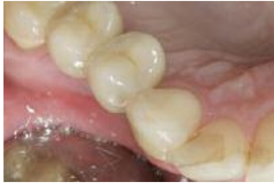
Fig. 20 All-ceramic crowns after cementing.