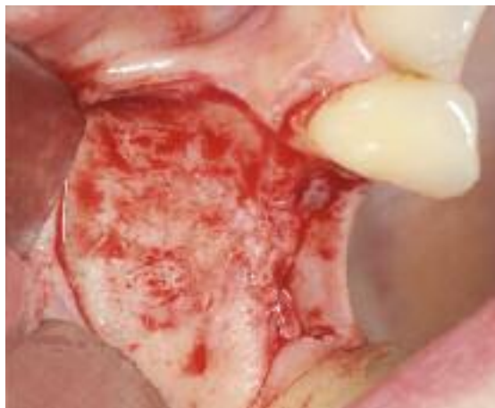
Fig. 2 Preparation of the mucoperiosteal flap to expose the vestibular wall of the maxillary sinus.