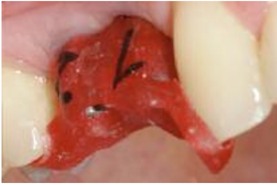
Fig. 19 Pattern resin index to test the correct placement of the abutments.