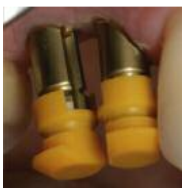
Fig. 16 Repositioning pressure posts.