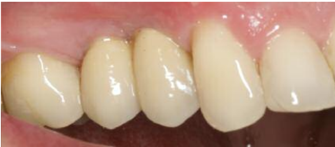
Fig. 21 Prosthetic placement of Bone Trust Plus implants at sites 14 and 15.

X-ray images showed very good ossification of the augmentate, and the two repositioning pressure posts were properly in place without any gaps.