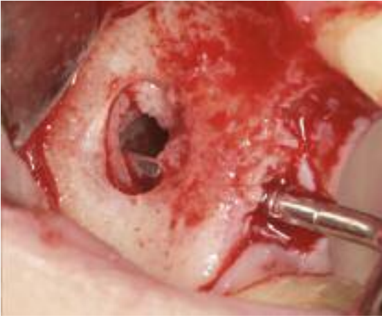
Fig. 8 Probing the implant cavity.