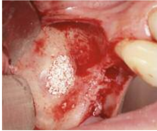
Fig. 9 Introducing the augmentation material.