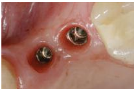
Fig. 14 The exposed Bone Trust Plus implants.