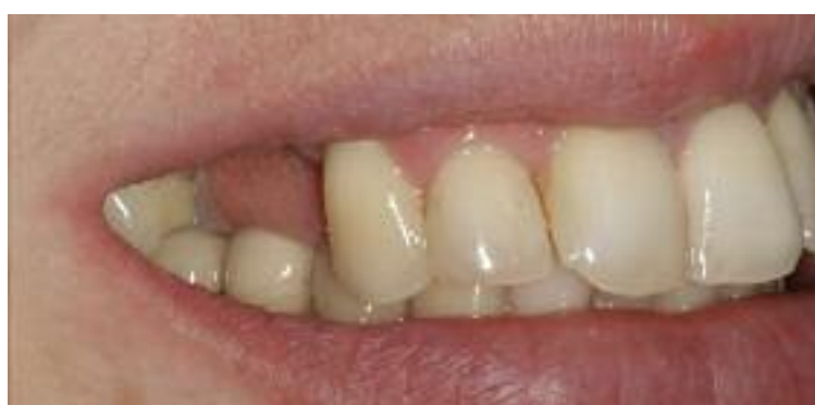
Fig. 17 Lip profile of the patient prior to insertion of the implant-supported superstructure.