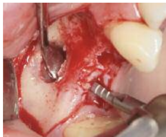
Fig. 5 Mechanical preparation of the implant cavities.