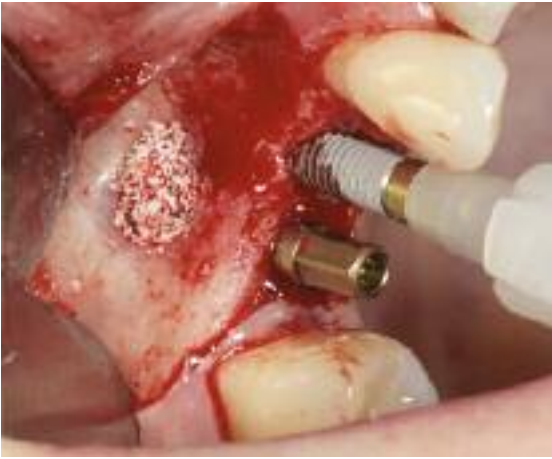
Fig. 10 Inserting the two Bone Trust Plus implants.