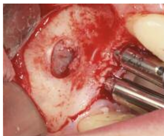
Fig. 7 Parallelization pins in situ.

with hyaluronic acid (Tissue Support) outside the mouth (Figs. 6 and 7). The great advantage of this technique is the plasticity or formability of the augmentation material resulting from the addition of