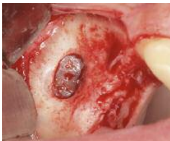
Fig. 4 The sealer residue has been removed without perforating the membrane.