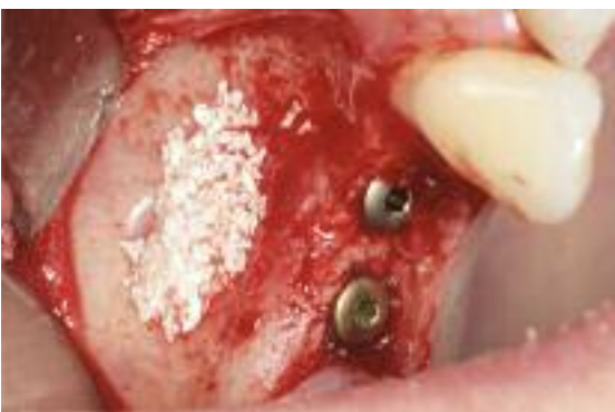
Fig. 12 Primary stability of the Bone Trust Plus implants.