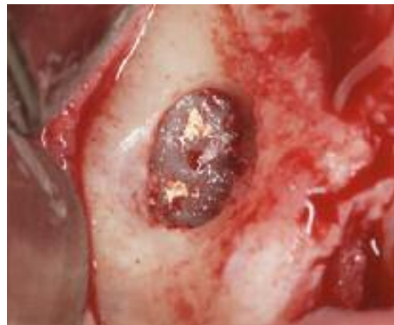
Fig. 3 Sealer residue on Schneiderian membrane.