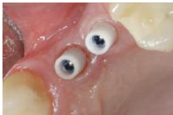
Fig. 15 Situation prior to cementing the crowns.