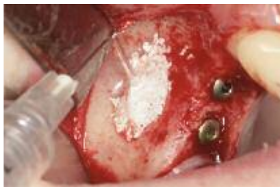
Fig. 13 Application of the Flex Barrier biomembrane.

Next we inserted the two Bone Trust Plus implants, which achieve excellent primary stability due to their specific macro-design, especially in the presence of intermediate bone quality or quantity. We removed the insertion posts using the hexagonal screwdriver, and inserted the locking screws (Figs. 10 to 12). Lateral coverage of the augmentation followed using